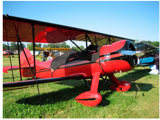
Waco UPF7 Canopy Cover