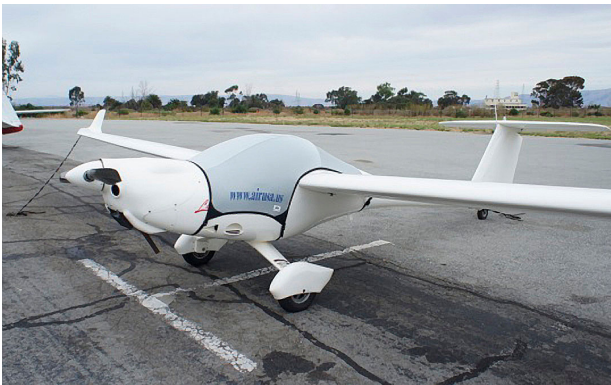
Lambda Canopy Cover