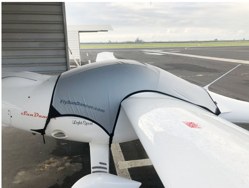
SUNDANCER Travel Cover with custom Imprint