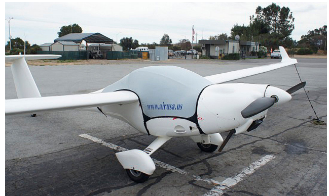
Lambda Travel Canopy Cover