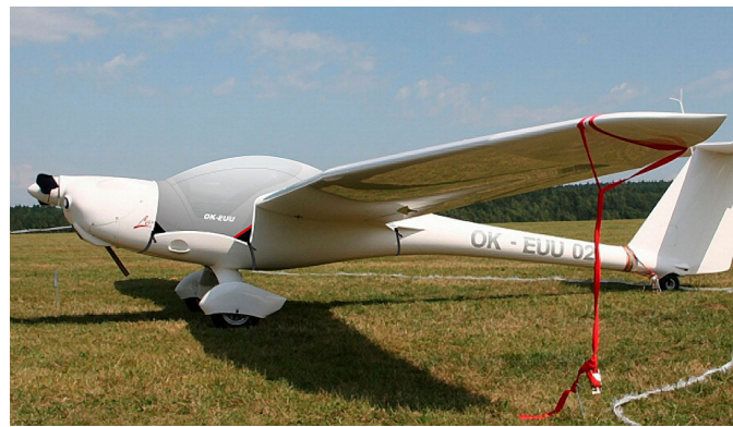
Lambda Canopy Cover (illustration)