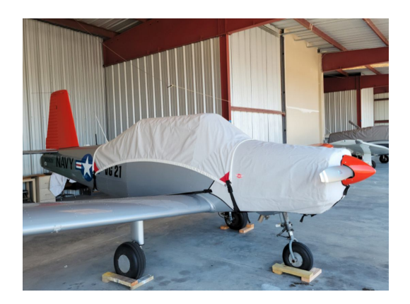
Varga Kachina Canopy & Engine Covers