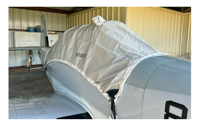
Varga Kachina Travel Cover, Light Weight Canopy Cover

Travel Covers are made with Silver Solution-Dyed Polyester fabric and only lined over the windshield to save weight. The material is lightweight and more compact for easy stowage in the aircraft. The polyester material is water resistant, but only intended for occasional use outside. We also have an ultra lightweight material available for fitted hangar dust covers. For daily outdoor use, the non-travel Sunbrella Cover is the best choice.