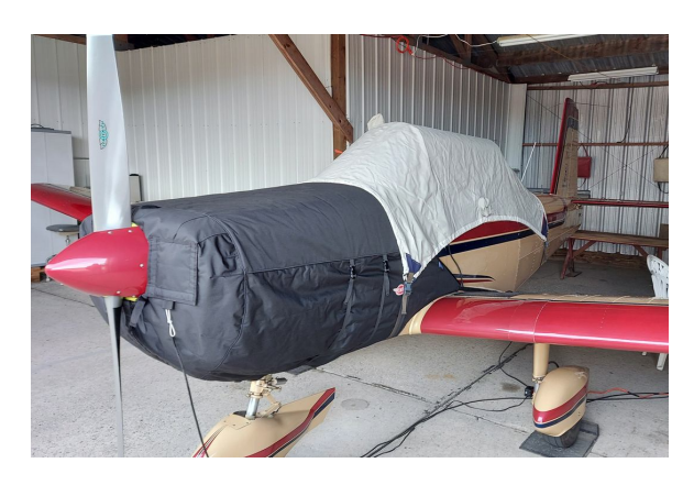
Varga 2150A Insulated Engine Cover, Canopy Cover

This cover type is made from Silver Acrylic Sunbrella canvas and is 100% lined with a soft and smooth microfiber. Bruce's Custom Covers developed this material combination especially for aircraft protection. The outer material is medium weight and treated for water resistance, UV resistance and anti-static buildup. The inner lining is a very soft and smooth microfiber to prevent scratching. The material is very reflective, and tests show that the cabin interior temperature can be reduced to near-ambient temperature on the hottest of days. It is water, ice and snow repellent, yet breathable to allow moisture to escape from between the cover and the aircraft surface.