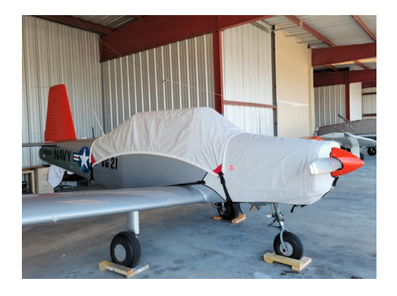
Varga Kachina Canopy & Engine Covers