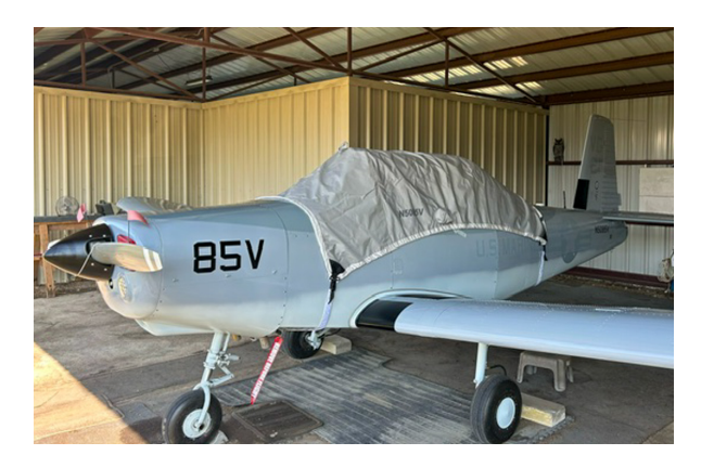
Varga Kachina Travel Cover, Light Weight Canopy Cover