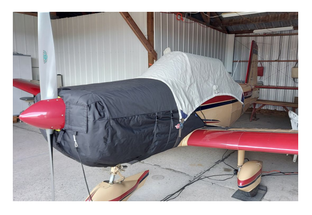
Varga 2150A Insulated Engine Cover, Canopy Cover

This cover type is made from Silver Acrylic Sunbrella canvas and is 100% lined with a soft and smooth microfiber. Bruce's Custom Covers developed this material combination especially for aircraft protection. The outer material is medium weight and treated for water resistance, UV resistance and anti-static buildup. The inner lining is a very soft and smooth microfiber to prevent scratching. The material is very reflective, and tests show that the cabin interior temperature can be reduced to near-ambient temperature on the hottest of days. It is water, ice and snow repellent, yet breathable to allow moisture to escape from between the cover and the aircraft surface.