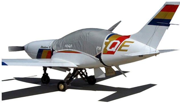
Questair Venture Canopy Cover