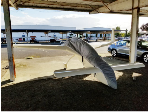
Rutan Vari EZ Travel Cover/Nose/Engine Cover