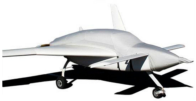
Velocity Canopy/Nose/Engine Cover