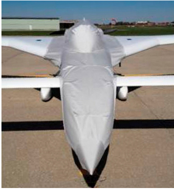
Long EZ Canopy/Nose/Engine Cover w/ Wing Extensions