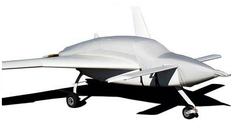
Velocity Canopy/Nose/Engine Cover