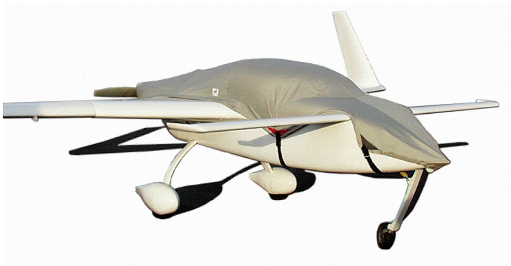
Cozy III Canopy/Nose/Engine Cover