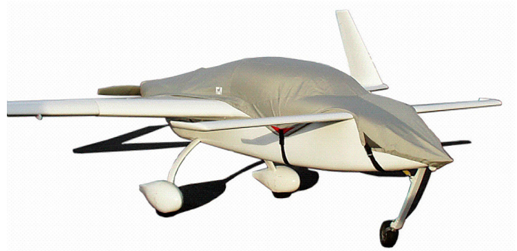
Cozy III Canopy/Nose/Engine Cover