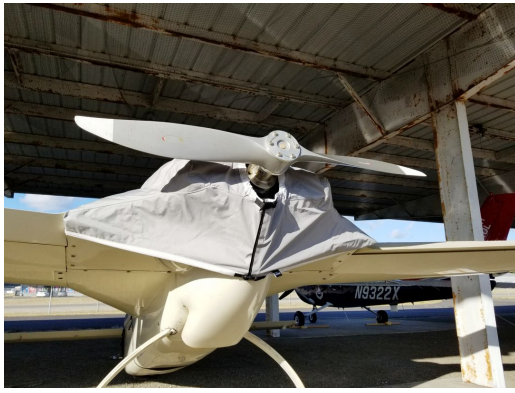
Rutan Vari EZ Travel Cover/Nose/Engine Cover