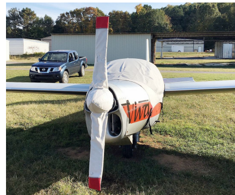
Aerotechnik L-13 Vivat Motorglider Prop/Spinner &amp; Canopy Covers