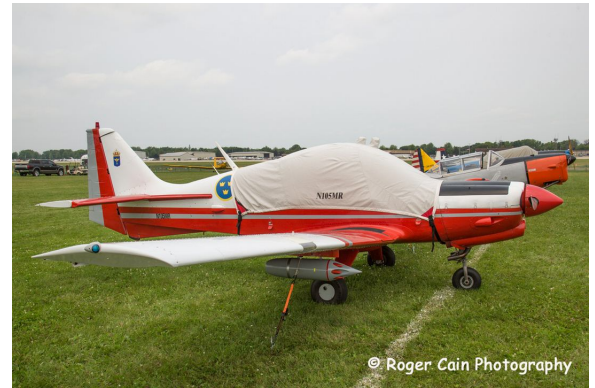
Scottish Aviation Bulldog Canopy Cover