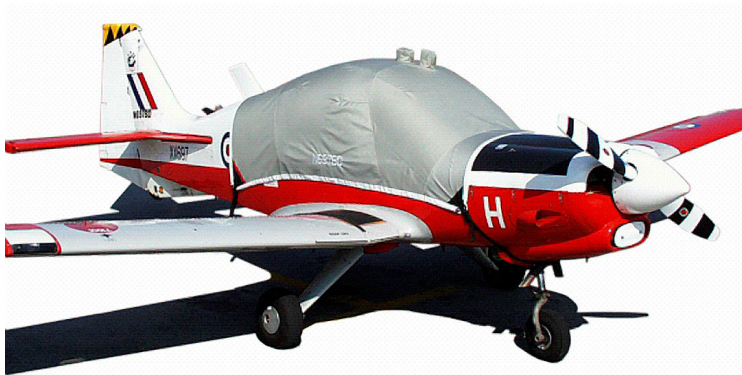
Scottish Aviation Bulldog Canopy Cover

Travel Covers are made with Silver Solution-Dyed Polyester fabric and only lined over the windshield to save weight. The material is lightweight and more compact for easy stowage in the aircraft. The polyester material is water resistant, but only intended for occasional use outside. We also have an ultra lightweight material available for fitted hangar dust covers. For daily outdoor use, the non-travel Sunbrella Cover is the best choice.