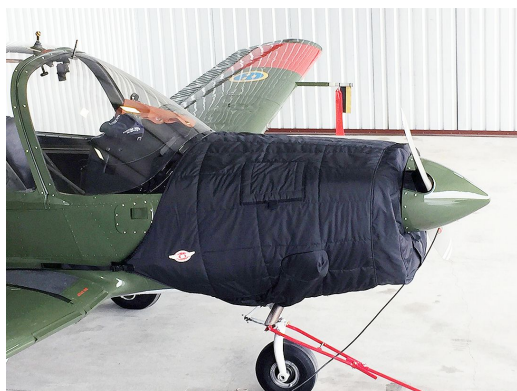
Scottish Aviation Bulldog Insulated Engine Cover

This cover type is made from Silver Acrylic Sunbrella canvas and is 100% lined with a soft and smooth microfiber. Bruce's Custom Covers developed this material combination especially for aircraft protection. The outer material is medium weight and treated for water resistance, UV resistance and anti-static buildup. The inner lining is a very soft and smooth microfiber to prevent scratching. The material is very reflective, and tests show that the cabin interior temperature can be reduced to near-ambient temperature on the hottest of days. It is water, ice and snow repellent, yet breathable to allow moisture to escape from between the cover and the aircraft surface.