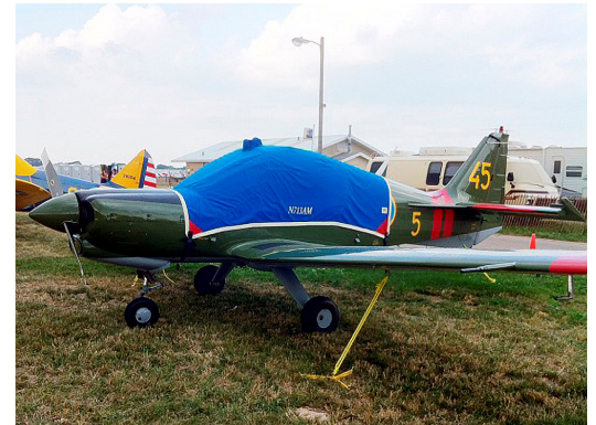
Scottish Aviation Bulldog Canopy Cover