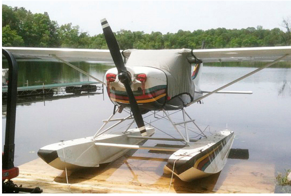
Glastar Sportsman Canopy Cover and Engine Plugs