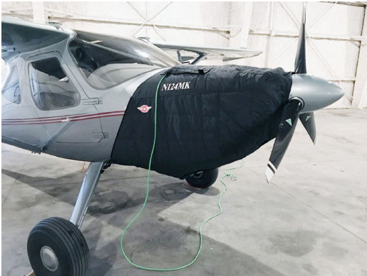
Glasair Aviation Glastar, Sportsman 2+2 Insulated Engine Cover