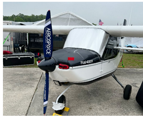
Vashon Ranger Engine Inlet Plugs