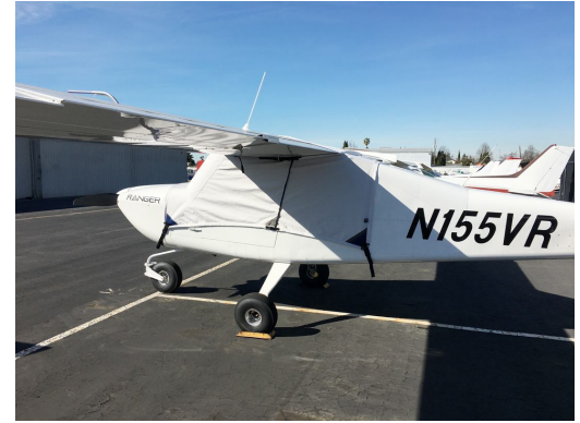
Glasair Aviation Glastar, Sportsman 2+2 Canopy Cover (Over-The-Top Style) Vashon Ranger R7 Canopy Cover, Over-Top Type