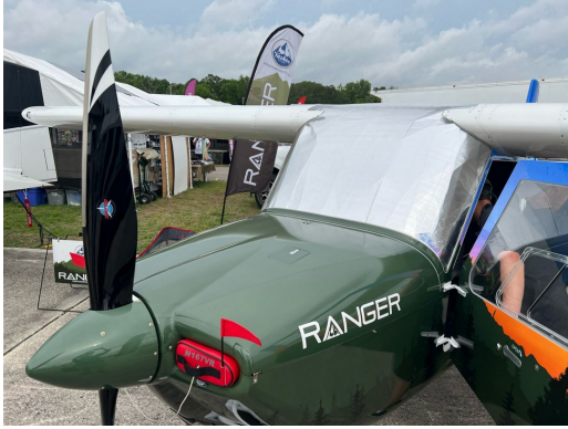
Vashon Ranger VR-7 Engine Plugs, Windshield HeatShield

window framing. It folds up flat and easily stores in the included storage sleeve. Some designs may require velcro and suction cups or split right and left sides. A Heatshield is an excellent short-term remedy for cockpit overheating. An external fabric cover is far more effective and practical for long-term protection.