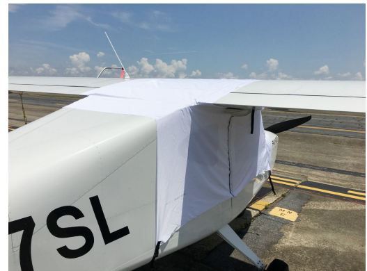
Vashon Ranger VR-7 Canopy Cover, test fit cover