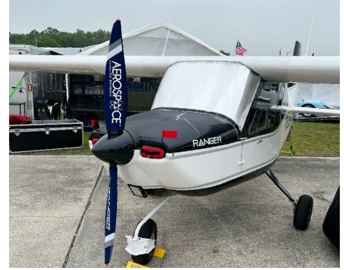
Vashon Ranger Engine Inlet Plugs