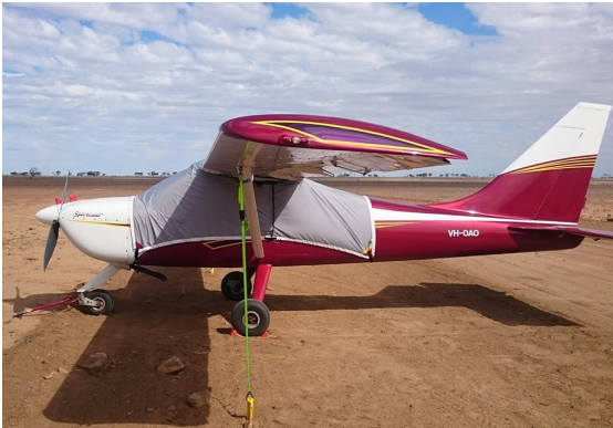
Glastar Sportsman Light Weight Travel Cover