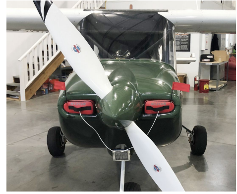
Vashon Ranger R7 Engine Plugs