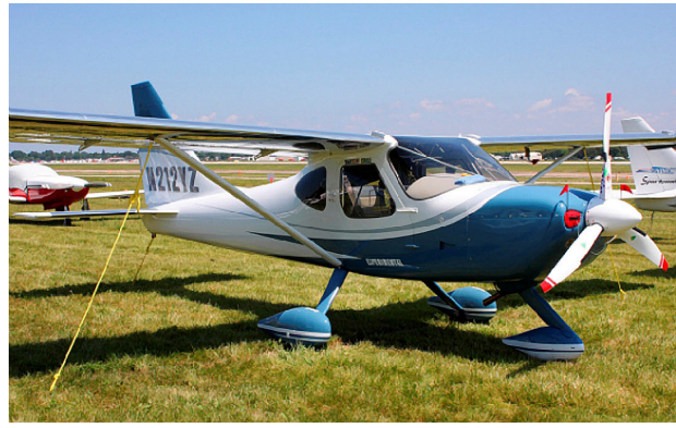
Glasstar Sportsman Engine Inlet Plugs