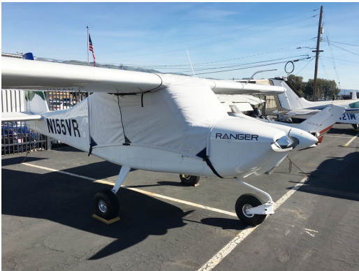
Vashon Ranger R7 Canopy Cover, Over-Top Type