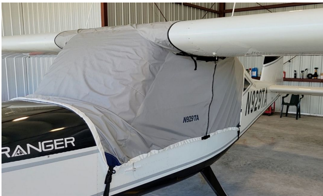
Vashon Ranger R7 Travel Weight Canopy Cover

Travel Covers are made with Silver Solution-Dyed Polyester fabric and only lined over the windshield to save weight. The material is lightweight and more compact for easy stowage in the aircraft. The polyester material is water resistant, but only intended for occasional use outside. We also have an ultra lightweight material available for fitted hangar dust covers. For daily outdoor use, the non-travel Sunbrella Cover is the best choice.