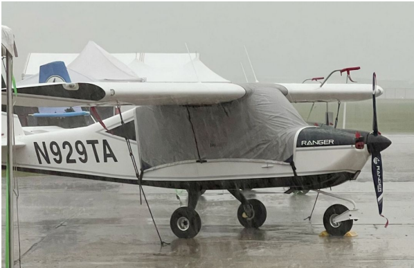
Vashon Ranger Canopy Cover

Travel Covers are made with Silver Solution-Dyed Polyester fabric and only lined over the windshield to save weight. The material is lightweight and more compact for easy stowage in the aircraft. The polyester material is water resistant, but only intended for occasional use outside. We also have an ultra lightweight material available for fitted hangar dust covers. For daily outdoor use, the non-travel Sunbrella Cover is the best choice.