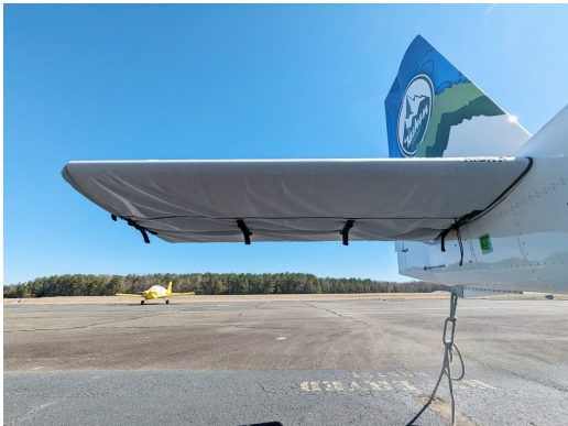
Vashon R7 Ranger Horiz. Stab. Covers, fully enclosed

WINTER USE MATERIAL - Made with Solution-Dyed Polyester fabric, this option is intended for seasonal use to aid in deicing, rain mitigation, or for occasional travel. The material is lighter and more compact, but more susceptible to UV damage and may have a shorter useful life if used continuously outside than the all-year use material.