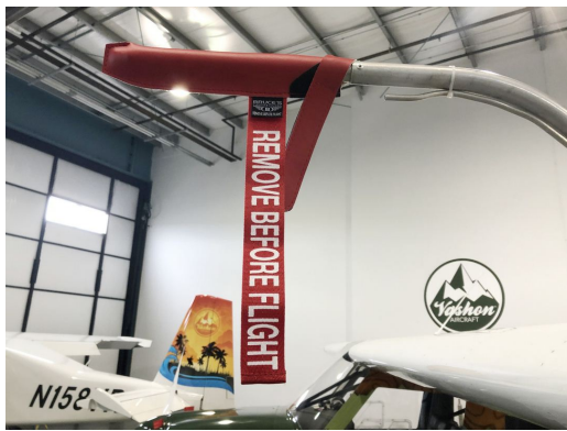
Vashon Ranger R7 Pitot Cover