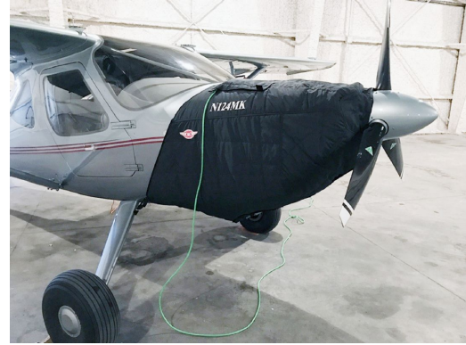
OMF Symphony Canopy, Wings, Horiz. Stab, and Prop Covers Glasair Aviation Glastar, Sportsman 2+2 Insulated Engine Cover