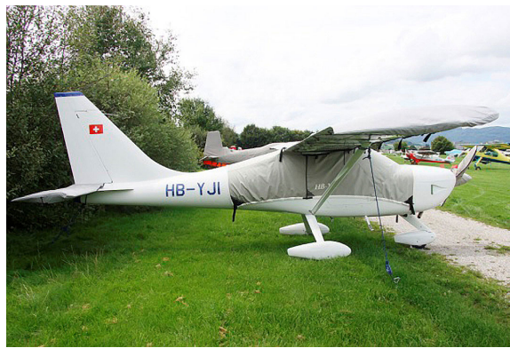
Glstar Canopy, Wings, Horizontal Stab. & Prop Covers