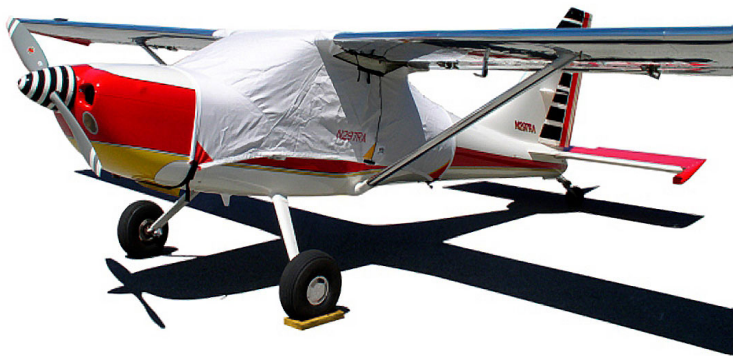
Glastar Over-Top Canopy Cover

This cover type is made from Silver Acrylic Sunbrella canvas and is 100% lined with a soft and smooth microfiber. Bruce's Custom Covers developed this material combination especially for aircraft protection. The outer material is medium weight and treated for water resistance, UV resistance and anti-static buildup. The inner lining is a very soft and smooth microfiber to prevent scratching. The material is very reflective, and tests show that the cabin interior temperature can be reduced to near-ambient temperature on the hottest of days. It is water, ice and snow repellent, yet breathable to allow moisture to escape from between the cover and the aircraft surface.