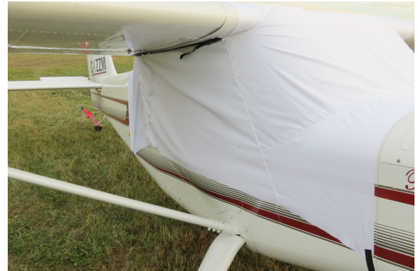
Pelican Canopy Cover (test fit cover)