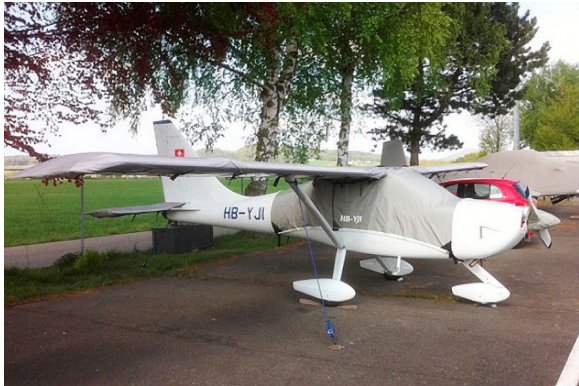
OMF Symphony Canopy, Wings, Horiz. Stab, and Prop Covers

This cover type is made from Silver Acrylic Sunbrella canvas and is 100% lined with a soft and smooth microfiber. Bruce's Custom Covers developed this material combination especially for aircraft protection. The outer material is medium weight and treated for water resistance, UV resistance and anti-static buildup. The inner lining is a very soft and smooth microfiber to prevent scratching. The material is very reflective, and tests show that the cabin interior temperature can be reduced to near-ambient temperature on the hottest of days. It is water, ice and snow repellent, yet breathable to allow moisture to escape from between the cover and the aircraft surface.