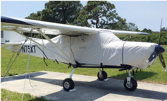
World Aircraft Extended Canopy Cover & Engine Cover

This cover type is made from Silver Acrylic Sunbrella canvas and is 100% lined with a soft and smooth microfiber. Bruce's Custom Covers developed this material combination especially for aircraft protection. The outer material is medium weight and treated for water resistance, UV resistance and anti-static buildup. The inner lining is a very soft and smooth microfiber to prevent scratching. The material is very reflective, and tests show that the cabin interior temperature can be reduced to near-ambient temperature on the hottest of days. It is water, ice and snow repellent, yet breathable to allow moisture to escape from between the cover and the aircraft surface.