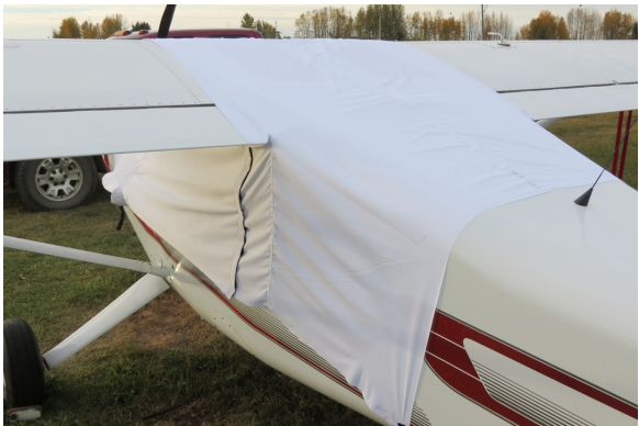
Pelican Canopy Cover (test fit cover)