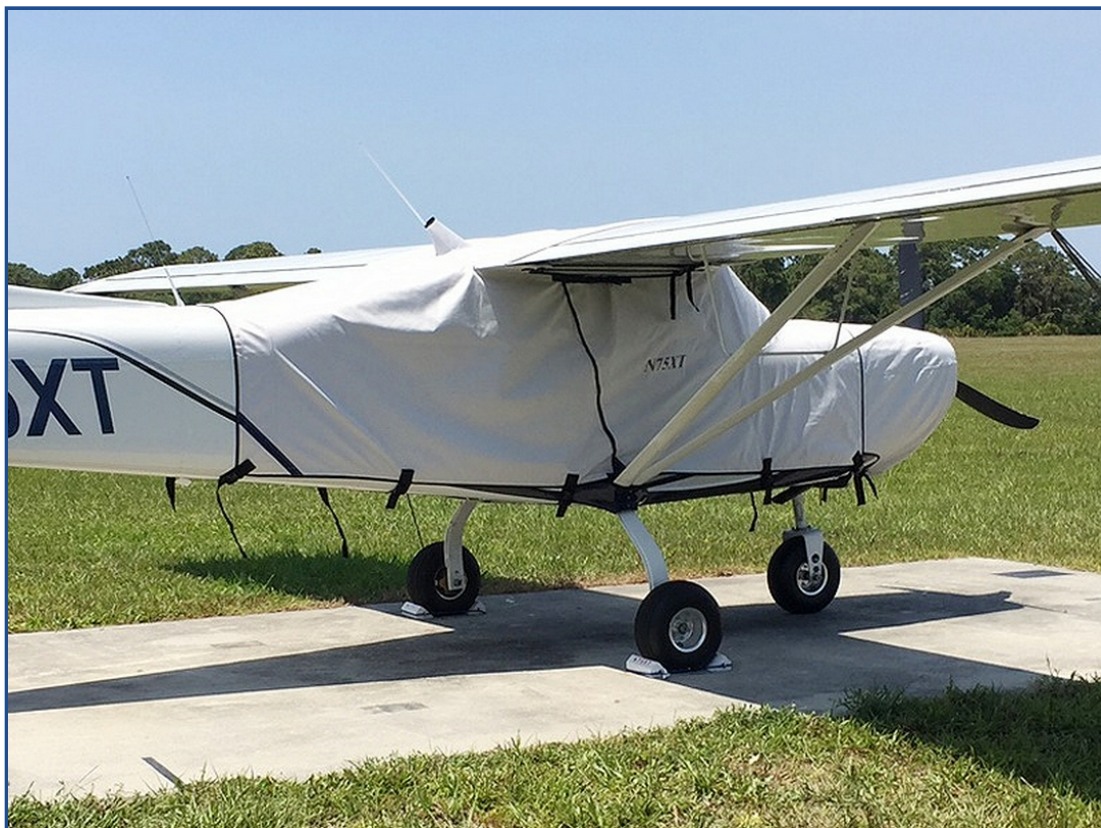
World Aircraft Extended Canopy Cover &amp; Engine Cover