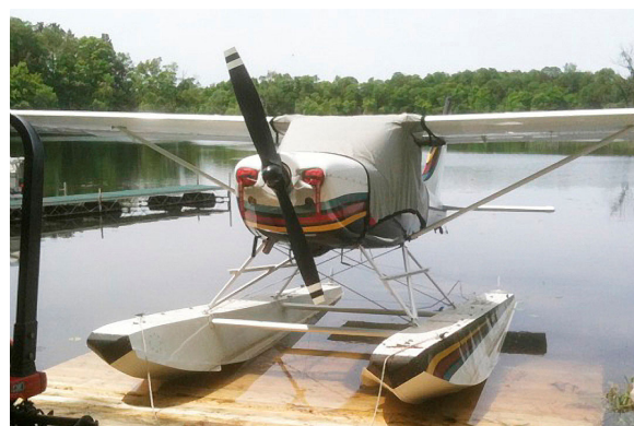
Glastar Sportsman Canopy Cover and Engine Plugs