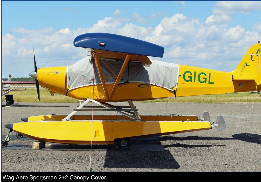
Wag Aero Sportsman 2+2 Canopy Cover