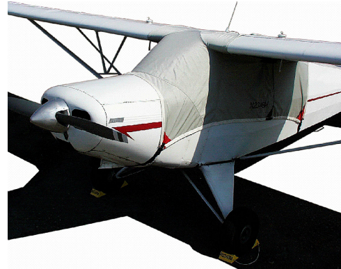
Piper PA-12 Super Cruiser Over-Top Canopy Cover