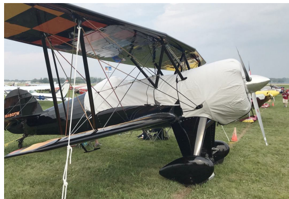
Waco Taperwing Cockpit & Engine Covers