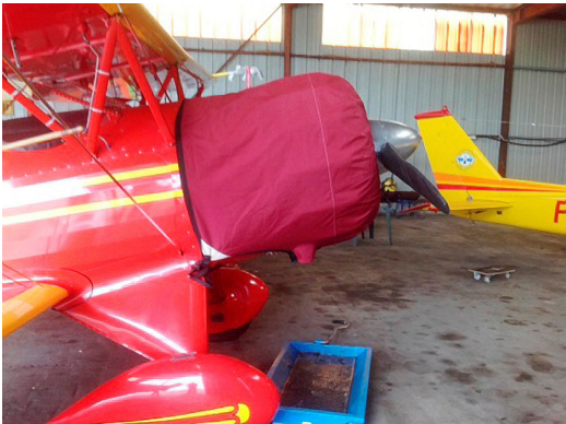
Waco Engine Cover

This cover type is made from Silver Acrylic Sunbrella canvas and is 100% lined with a soft and smooth microfiber. Bruce's Custom Covers developed this material combination especially for aircraft protection. The outer material is medium weight and treated for water resistance, UV resistance and anti-static buildup. The inner lining is a very soft and smooth microfiber to prevent scratching. The material is very reflective, and tests show that the cabin interior temperature can be reduced to near-ambient temperature on the hottest of days. It is water, ice and snow repellent, yet breathable to allow moisture to escape from between the cover and the aircraft surface.