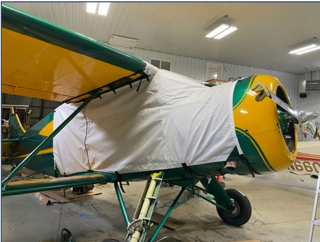
Waco Cabin Biplane Cabin Cover (Over Top Type), Ext. To Cover Baggage Door