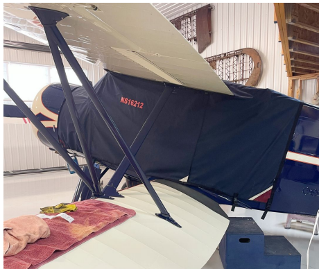
Waco YQC-6 Canopy Cover, over-top type