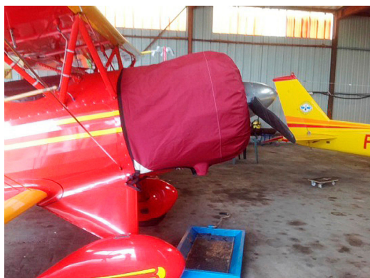
Waco Engine Cover