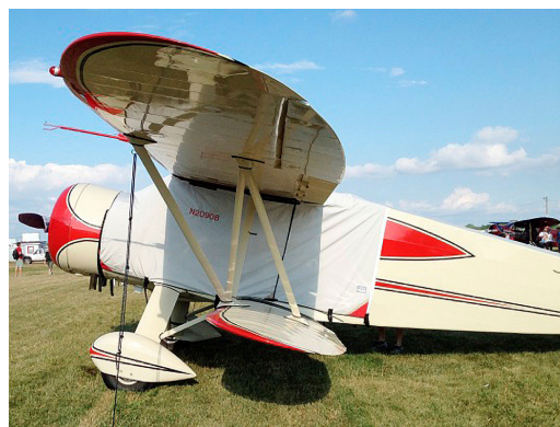
Waco AGC-8 Over-the-Top Canopy Cover