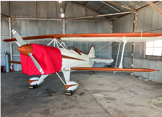
SKYBOLT, Insulated Hangar Blanket, Custom Fit Interior Use)