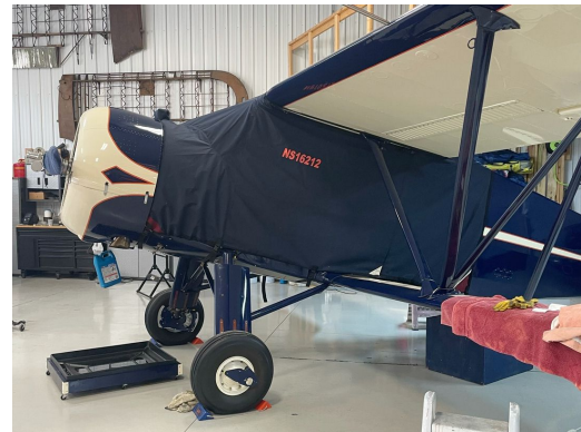
Waco YQC-6 Canopy Cover, over-top type