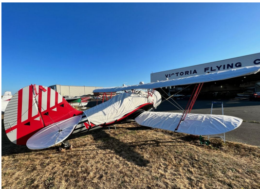
Waco YMF-5 Engine, Extended Canopy, Wing Covers & Horizontal Stab Covers

WINTER USE MATERIAL - Made with Solution-Dyed Polyester fabric, this option is intended for seasonal use to aid in deicing, rain mitigation, or for occasional travel. The material is lighter and more compact, but more susceptible to UV damage and may have a shorter useful life if used continuously outside than the all-year use material.