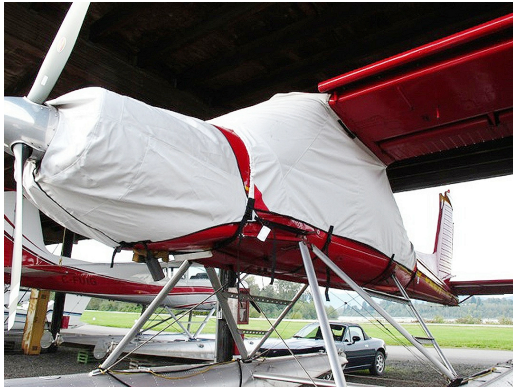
Wilga 2000 Canopy and Engine Covers

water resistance, UV resistance and anti-static buildup. The inner lining is a very soft and smooth microfiber to prevent scratching. The material is very reflective, and tests show that the cabin interior temperature can be reduced to near-ambient temperature on the hottest of days. It is water, ice and snow repellent, yet breathable to allow moisture to escape from between the cover and the aircraft surface.