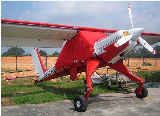
Wilga Canopy Cover

water resistance, UV resistance and anti-static buildup. The inner lining is a very soft and smooth microfiber to prevent scratching. The material is very reflective, and tests show that the cabin interior temperature can be reduced to near-ambient temperature on the hottest of days. It is water, ice and snow repellent, yet breathable to allow moisture to escape from between the cover and the aircraft surface.