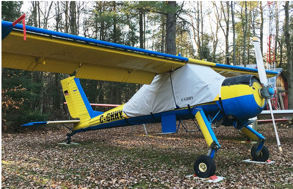
PZL-104-35 WILGA CANOPY COVER