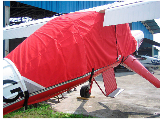
Wilga Canopy Cover