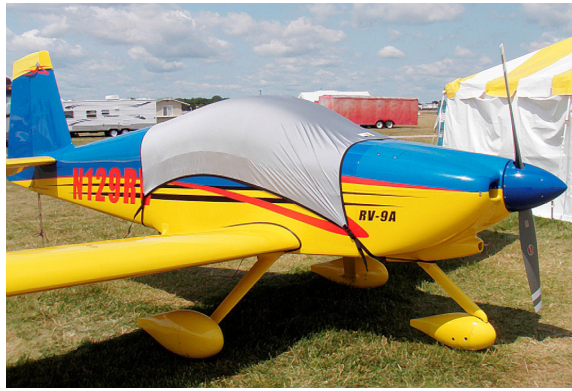
Van's RV-9A Light Weight Travel-Cover