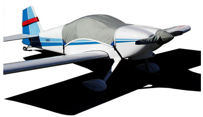
Canopy Cover, Prop Cover