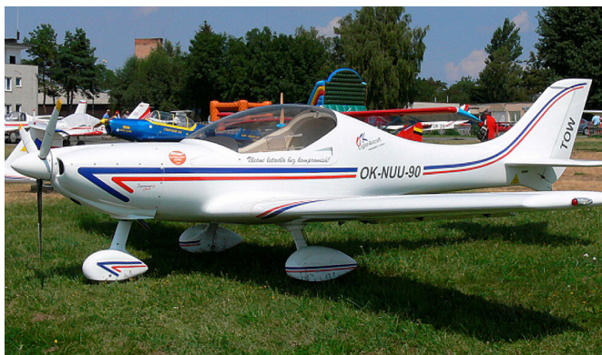
Covers, Plugs & HeatShields for Dynamic WT9

This cover type is made from Silver Acrylic Sunbrella canvas and is 100% lined with a soft and smooth microfiber. Bruce's Custom Covers developed this material combination especially for aircraft protection. The outer material is medium weight and treated for water resistance, UV resistance and anti-static buildup. The inner lining is a very soft and smooth microfiber to prevent scratching. The material is very reflective, and tests show that the cabin interior temperature can be reduced to near-ambient temperature on the hottest of days. It is water, ice and snow repellent, yet breathable to allow moisture to escape from between the cover and the aircraft surface.