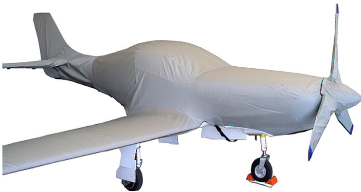
Lancair 320 Complete Fuselage/Wing Cover & Prop Cover

This cover type is made from Silver Acrylic Sunbrella canvas and is 100% lined with a soft and smooth microfiber. Bruce's Custom Covers developed this material combination especially for aircraft protection. The outer material is medium weight and treated for water resistance, UV resistance and anti-static buildup. The inner lining is a very soft and smooth microfiber to prevent scratching. The material is very reflective, and tests show that the cabin interior temperature can be reduced to near-ambient temperature on the hottest of days. It is water, ice and snow repellent, yet breathable to allow moisture to escape from between the cover and the aircraft surface.