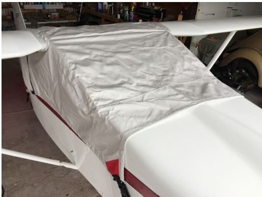
Wittman Tailwind Canopy Cover, Over-The-Top

This cover type is made from Silver Acrylic Sunbrella canvas and is 100% lined with a soft and smooth microfiber. Bruce's Custom Covers developed this material combination especially for aircraft protection. The outer material is medium weight and treated for water resistance, UV resistance and anti-static buildup. The inner lining is a very soft and smooth microfiber to prevent scratching. The material is very reflective, and tests show that the cabin interior temperature can be reduced to near-ambient temperature on the hottest of days. It is water, ice and snow repellent, yet breathable to allow moisture to escape from between the cover and the aircraft surface.