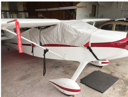
Wittman Tailwind Canopy Cover, Over-The-Top

This cover type is made from Silver Acrylic Sunbrella canvas and is 100% lined with a soft and smooth microfiber. Bruce's Custom Covers developed this material combination especially for aircraft protection. The outer material is medium weight and treated for water resistance, UV resistance and anti-static buildup. The inner lining is a very soft and smooth microfiber to prevent scratching. The material is very reflective, and tests show that the cabin interior temperature can be reduced to near-ambient temperature on the hottest of days. It is water, ice and snow repellent, yet breathable to allow moisture to escape from between the cover and the aircraft surface.