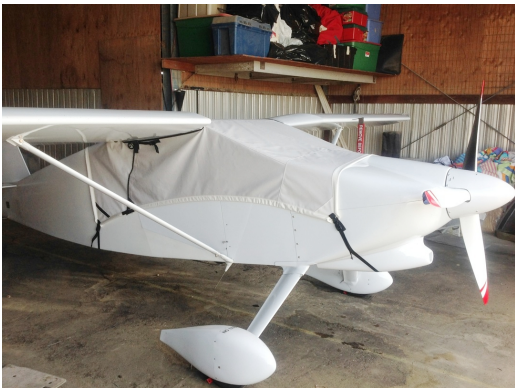
Wittman Tailwind Canopy Cover