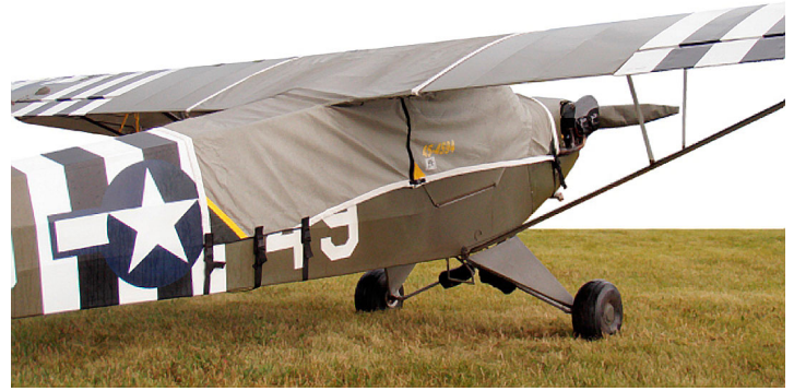
Piper J3 Extended Canopy Cover & Propellor Cover