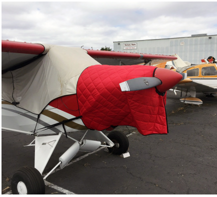
FOR INTERIOR USE. Cub Crafters CC-11 Insulated Hangar Blanket, available in Red or Silver