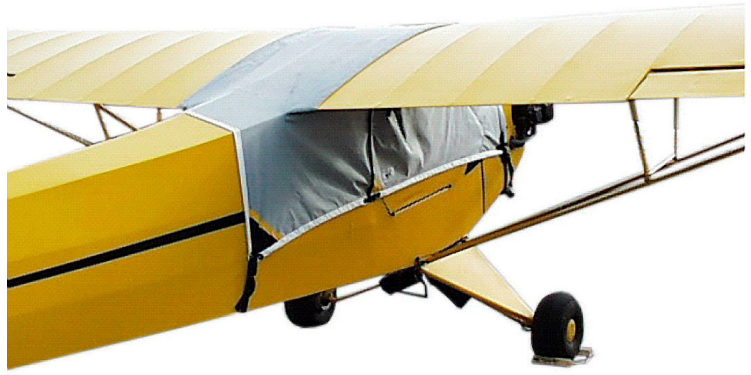
Piper J3 Over-Top Canopy Cover