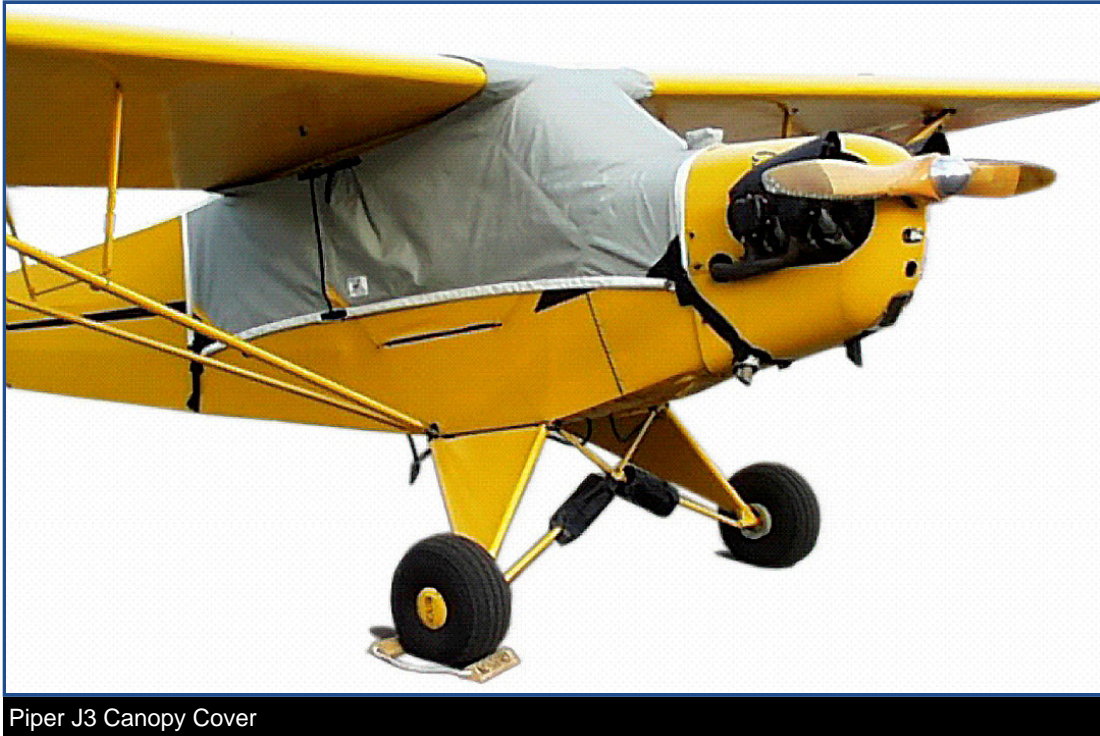
Piper J3 Canopy Cover