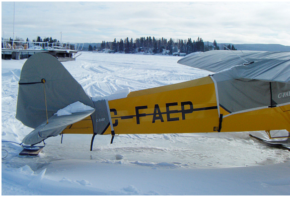
Piper J3 Cub Abbreviated Empennage Cover, Wing Covers and Canopy Cover