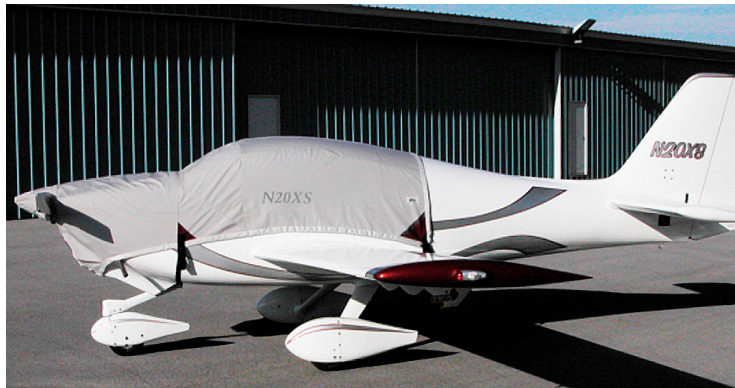
Canopy/Engine and Prop/Spinner Covers (tri-gear model)

Travel Covers are made with Silver Solution-Dyed Polyester fabric and only lined over the windshield to save weight. The material is lightweight and more compact for easy stowage in the aircraft. The polyester material is water resistant, but only intended for occasional use outside. We also have an ultra lightweight material available for fitted hangar dust covers. For daily outdoor use, the non-travel Sunbrella Cover is the best choice.