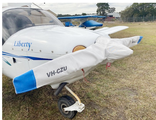
XL-2 PROPELLOR/SPINNER COVER