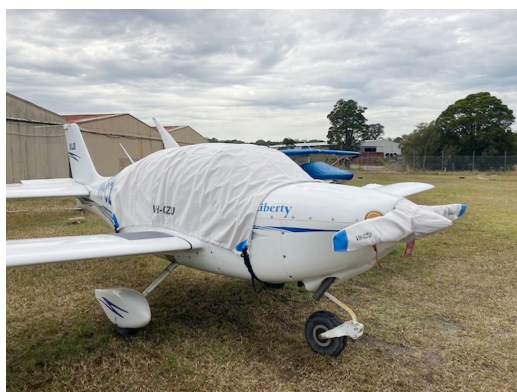
XL-2 CANOPY COVER

This cover type is made from Silver Acrylic Sunbrella canvas and is 100% lined with a soft and smooth microfiber. Bruce's Custom Covers developed this material combination especially for aircraft protection. The outer material is medium weight and treated for water resistance, UV resistance and anti-static buildup. The inner lining is a very soft and smooth microfiber to prevent scratching. The material is very reflective, and tests show that the cabin interior temperature can be reduced to near-ambient temperature on the hottest of days. It is water, ice and snow repellent, yet breathable to allow moisture to escape from between the cover and the aircraft surface.