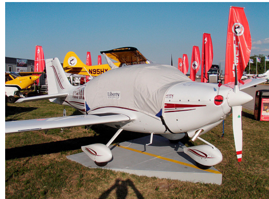
XL-2 Canopy Cover & Engine Plugs