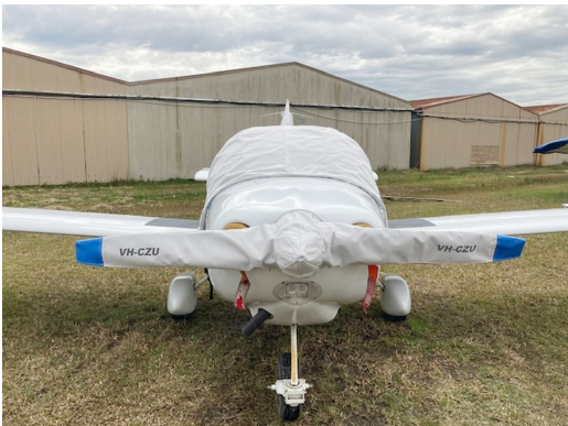
XL-2 PROPELLOR/SPINNER COVER