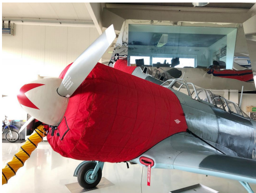
Yak 11 Insulated Engine Cover & Oil Cooler Inlet Plug

Engine Inlet Plugs are custom fit for your Yakovlev Yak 11 intakes, made with heavy-duty vinyl material, and stuffed with a single block of sculpted urethane foam. Each plug has a zipper that allows the foam to be removed and dried if necessary. Engine plugs have warning flags that are visible from the cockpit or 'remove before flight' streamers sewn onto the face of the plugs. Most plugs are imprinted with the aircraft registration number in black for an extra charge. Storage bag NOT included. Engine plugs may be inserted after flight when the engine is still warm. Engine Inlet Plugs are commonly referred to as Cowl Plugs, Intake Plugs, Cowl Blocks, Engine Blocks, and Engine Bungs.