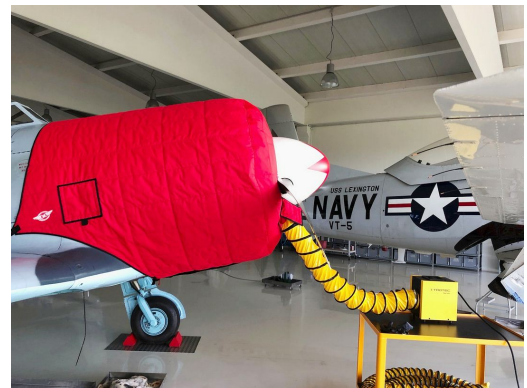
Yak 11 Insulated Engine Cover