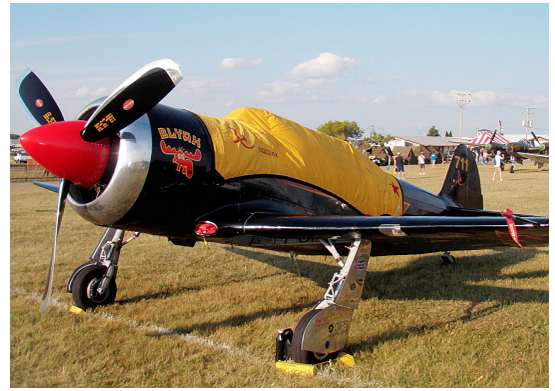
Yak 55 Full Fuselage Cover w/ Detachable Wing Covers & Propellor/Spinner Cover Yak 11 Canopy Cover, Plugs & Pitot Covers