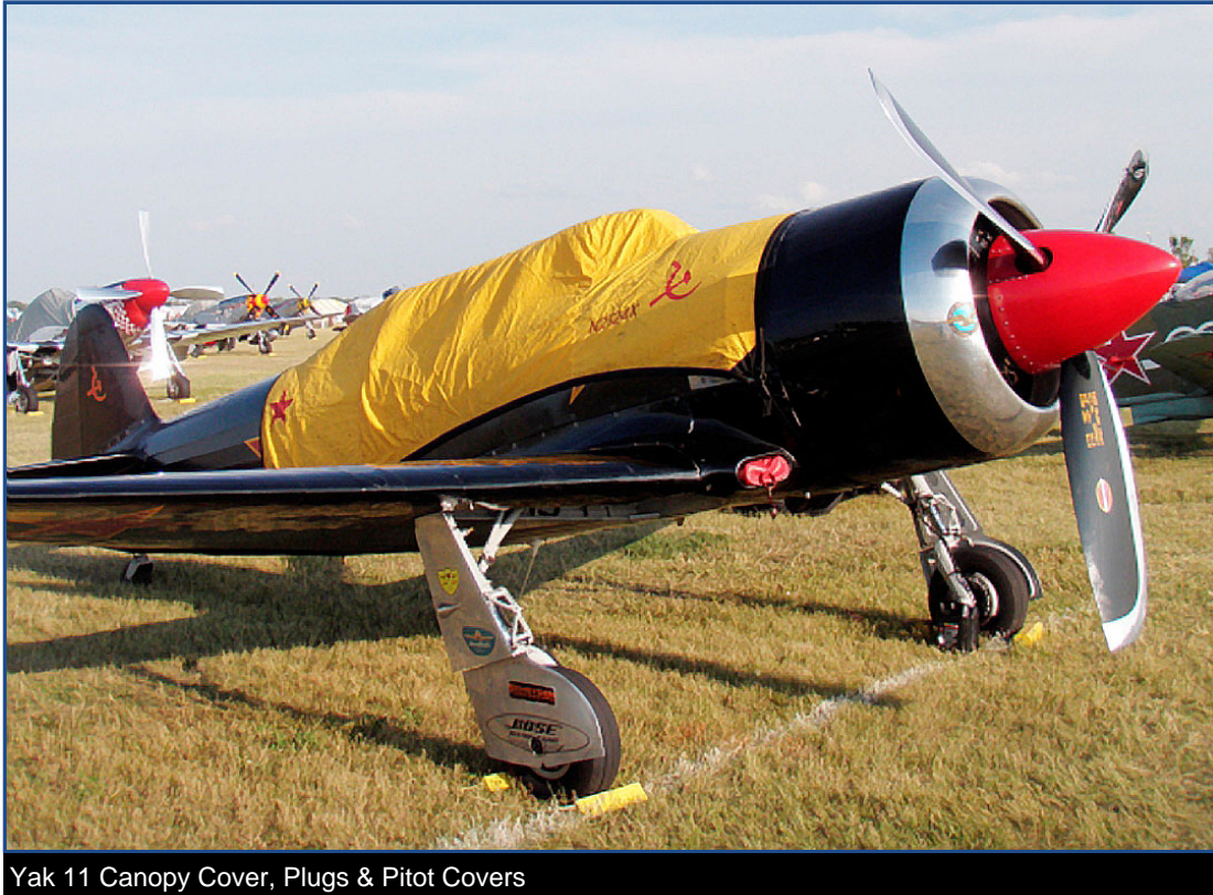
Yak 11 Canopy Cover, Plugs & Pitot Covers