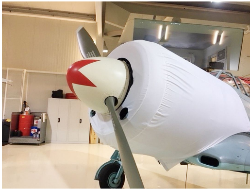
Yak 11 Engine Cover (test fit cover)