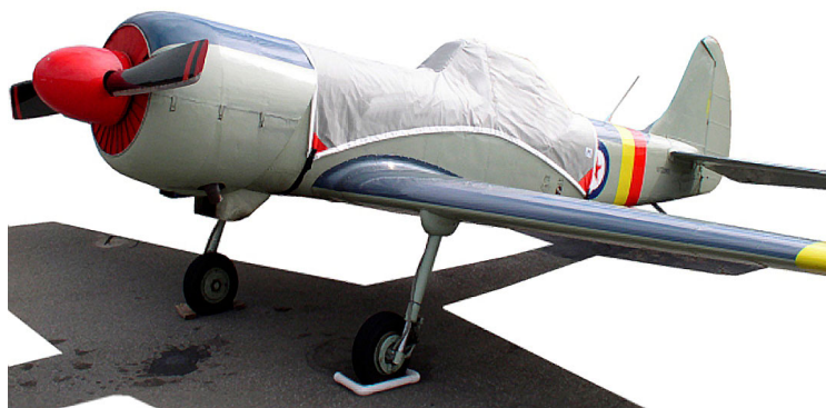
Yak 50 Canopy Cover