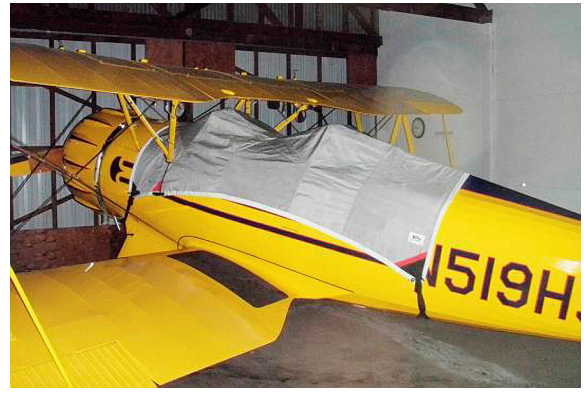
Waco YMF-5 Canopy Cover