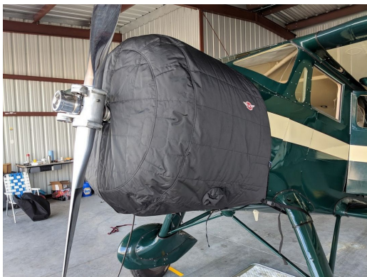
Wacon Cabin Biplane ZQC-6 Insulated Engine Cover