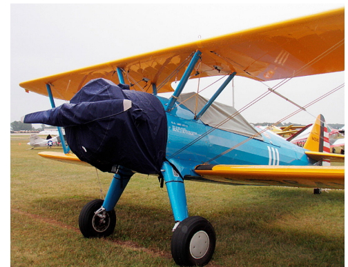
Stearman Canopy, Engine & Prop Covers