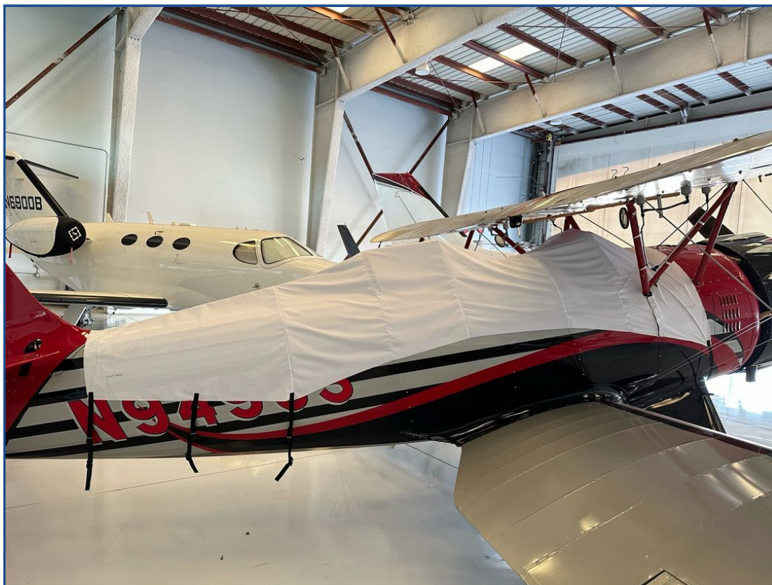
Waco YMF-5 Canopy with Turtledeck Extension, test fit cover