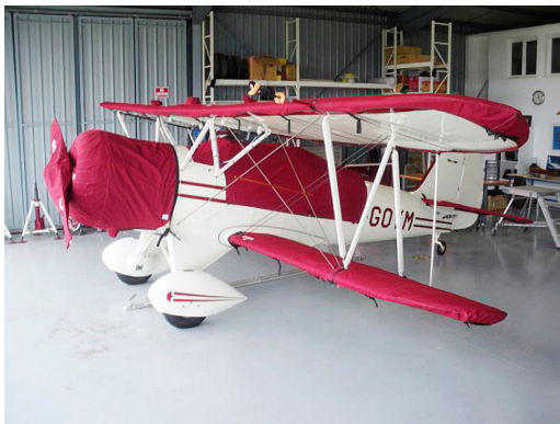
Waco UPF-7 Canopy, Wings, Stab's, Engine, Prop Covers

This cover type is made from Silver Acrylic Sunbrella canvas and is 100% lined with a soft and smooth microfiber. Bruce's Custom Covers developed this material combination especially for aircraft protection. The outer material is medium weight and treated for water resistance, UV resistance and anti-static buildup. The inner lining is a very soft and smooth microfiber to prevent scratching. The material is very reflective, and tests show that the cabin interior temperature can be reduced to near-ambient temperature on the hottest of days. It is water, ice and snow repellent, yet breathable to allow moisture to escape from between the cover and the aircraft surface.