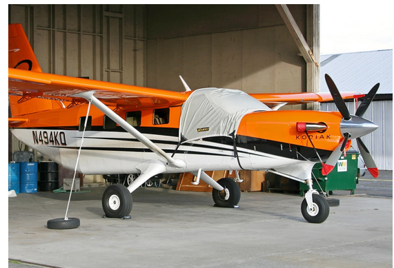
Quest Kodiak Windshield Cover, Prop Tie/Exhaust Covers, Engine Inlet Plugs & Pitot Cover