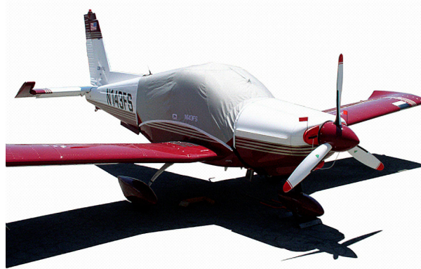
Zlin 143 Canopy Cover and Engine Plugs

This cover type is made from Silver Acrylic Sunbrella canvas and is 100% lined with a soft and smooth microfiber. Bruce's Custom Covers developed this material combination especially for aircraft protection. The outer material is medium weight and treated for water resistance, UV resistance and anti-static buildup. The inner lining is a very soft and smooth microfiber to prevent scratching. The material is very reflective, and tests show that the cabin interior temperature can be reduced to near-ambient temperature on the hottest of days. It is water, ice and snow repellent, yet breathable to allow moisture to escape from between the cover and the aircraft surface.