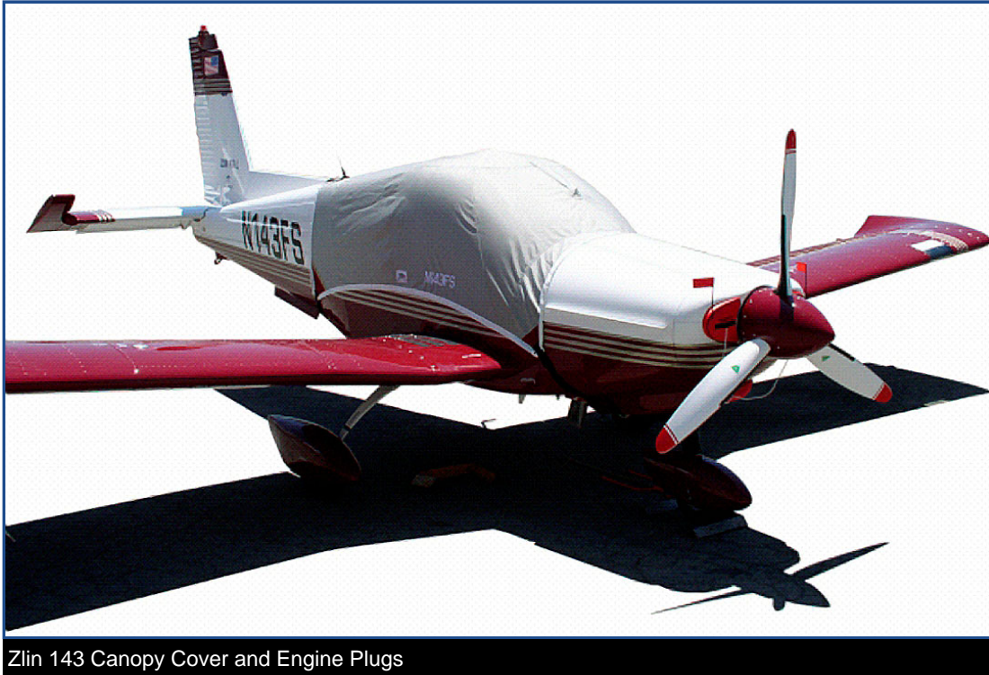
Zlin 143 Canopy Cover and Engine Plugs