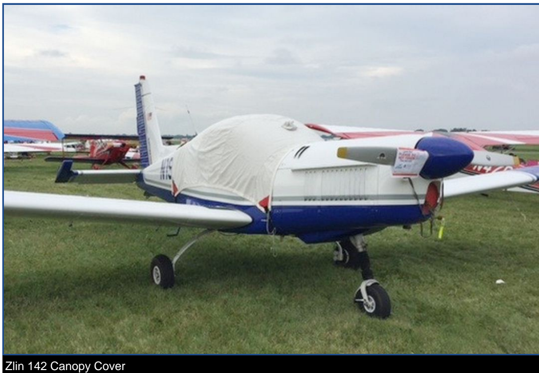
Zlin 142 Canopy Cover