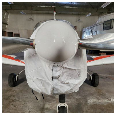
Zlin 142C Engine Cover, test fit cover