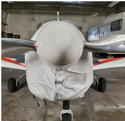
Zlin 142C Engine Cover, test fit cover

This cover type is made from Silver Acrylic Sunbrella canvas and is 100% lined with a soft and smooth microfiber. Bruce's Custom Covers developed this material combination especially for aircraft protection. The outer material is medium weight and treated for water resistance, UV resistance and anti-static buildup. The inner lining is a very soft and smooth microfiber to prevent scratching. The material is very reflective, and tests show that the cabin interior temperature can be reduced to near-ambient temperature on the hottest of days. It is water, ice and snow repellent, yet breathable to allow moisture to escape from between the cover and the aircraft surface.