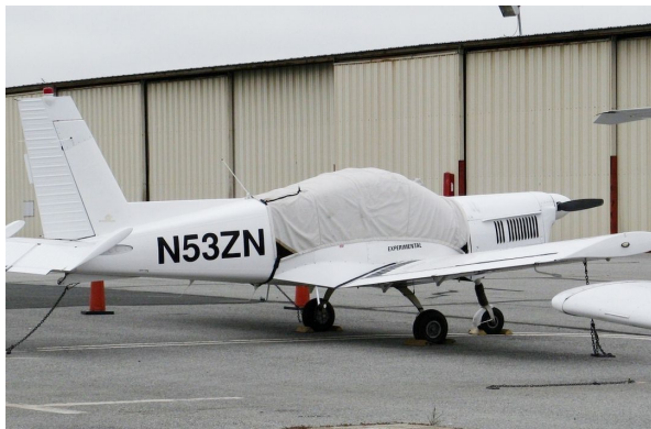
Zlin 142 Canopy Cover

Travel Covers are made with Silver Solution-Dyed Polyester fabric and only lined over the windshield to save weight. The material is lightweight and more compact for easy stowage in the aircraft. The polyester material is water resistant, but only intended for occasional use outside. We also have an ultra lightweight material available for fitted hangar dust covers. For daily outdoor use, the non-travel Sunbrella Cover is the best choice.