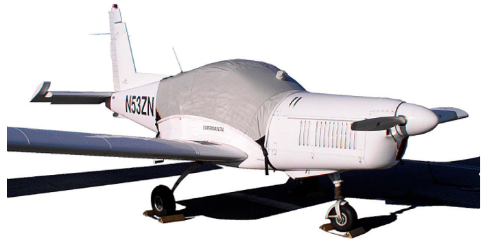
Zlin 142 Canopy Cover