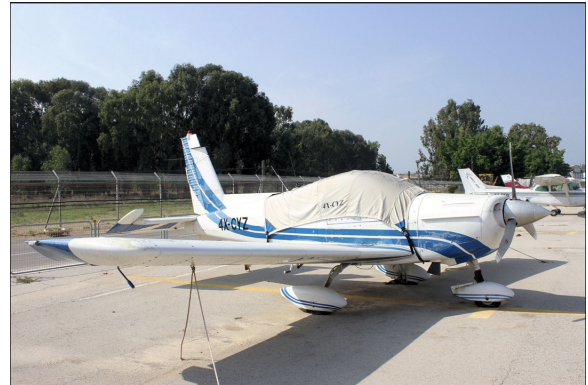
Zlin 142 Canopy Cover