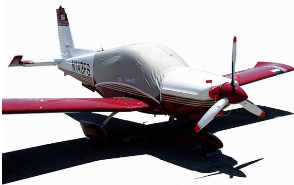
Zlin 143 Canopy Cover and Engine Plugs

This cover type is made from Silver Acrylic Sunbrella canvas and is 100% lined with a soft and smooth microfiber. Bruce's Custom Covers developed this material combination especially for aircraft protection. The outer material is medium weight and treated for water resistance, UV resistance and anti-static buildup. The inner lining is a very soft and smooth microfiber to prevent scratching. The material is very reflective, and tests show that the cabin interior temperature can be reduced to near-ambient temperature on the hottest of days. It is water, ice and snow repellent, yet breathable to allow moisture to escape from between the cover and the aircraft surface.