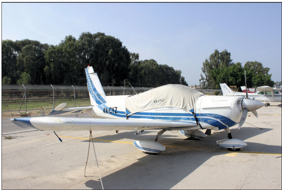
Zlin 142 Canopy Cover