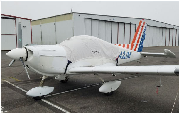
Zlin 242 Canopy Cover

This cover type is made from Silver Acrylic Sunbrella canvas and is 100% lined with a soft and smooth microfiber. Bruce's Custom Covers developed this material combination especially for aircraft protection. The outer material is medium weight and treated for water resistance, UV resistance and anti-static buildup. The inner lining is a very soft and smooth microfiber to prevent scratching. The material is very reflective, and tests show that the cabin interior temperature can be reduced to near-ambient temperature on the hottest of days. It is water, ice and snow repellent, yet breathable to allow moisture to escape from between the cover and the aircraft surface.