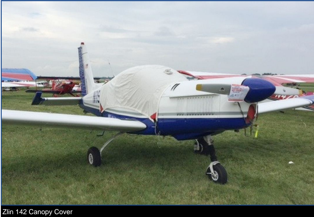
Zlin 142 Canopy Cover