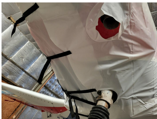
Zlin 142C Engine Cover, test fit cover

This cover type is made from Silver Acrylic Sunbrella canvas and is 100% lined with a soft and smooth microfiber. Bruce's Custom Covers developed this material combination especially for aircraft protection. The outer material is medium weight and treated for water resistance, UV resistance and anti-static buildup. The inner lining is a very soft and smooth microfiber to prevent scratching. The material is very reflective, and tests show that the cabin interior temperature can be reduced to near-ambient temperature on the hottest of days. It is water, ice and snow repellent, yet breathable to allow moisture to escape from between the cover and the aircraft surface.