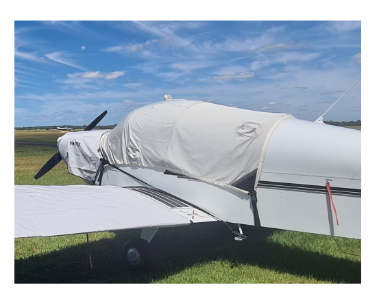
AMD Alarus CH2000 Std Canopy Cover & Engine Plugs (Illustration)