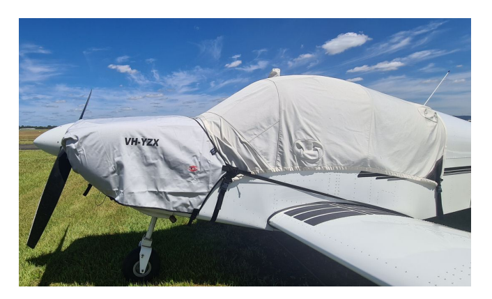
Cessna 172M Canopy, Wings, Horiz. Stab., Insulated Engine & Prop Covers