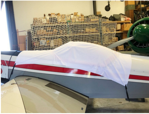
Zlin 526 Canopy Cover, test fit cover

the hottest of days. It is water, ice and snow repellent, yet breathable to allow moisture to escape from between the cover and the aircraft surface.