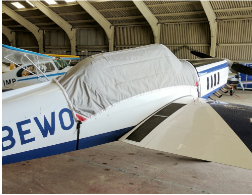
Zlin 326 Travel Cover

Travel Covers are made with Silver Solution-Dyed Polyester fabric and only lined over the windshield to save weight. The material is lightweight and more compact for easy stowage in the aircraft. The polyester material is water resistant, but only intended for occasional use outside. We also have an ultra lightweight material available for fitted hangar dust covers. For daily outdoor use, the non-travel Sunbrella Cover is the best choice.