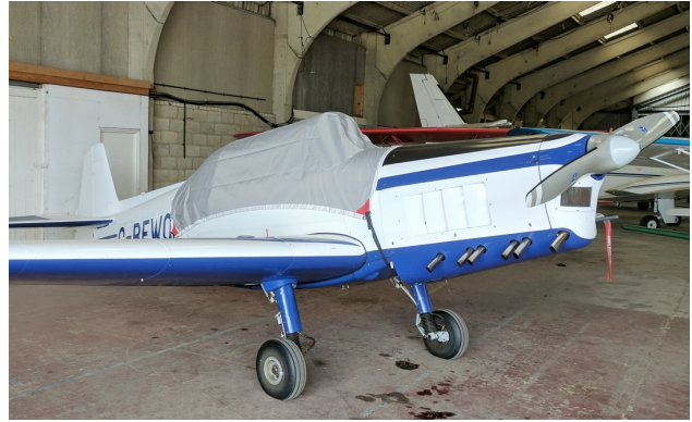
Zlin 326 Travel Cover